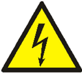
Warning against electric shock.

Exercise caution when connecting the battery pack to the system. Mind the stickers at each connector on the battery pack front panel.